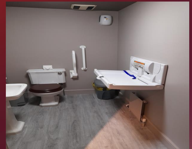
Baby changing facilities view