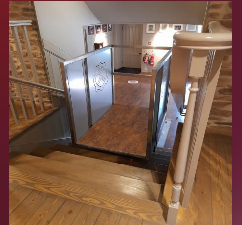
Wheelchair lift view