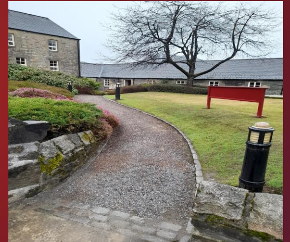
Lower Hall entrance path view