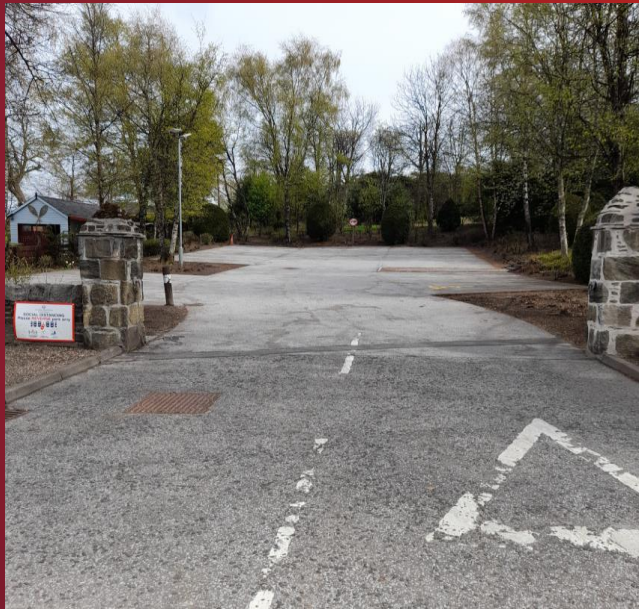
Carpark view from street