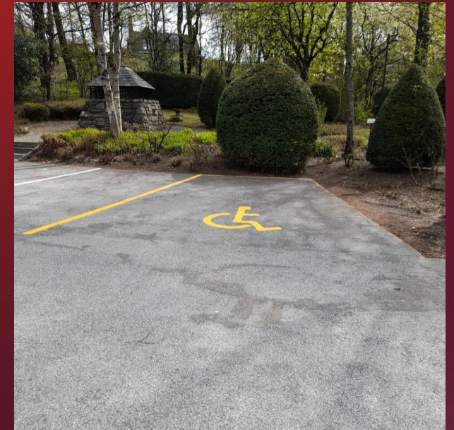
Disabled parking bay view