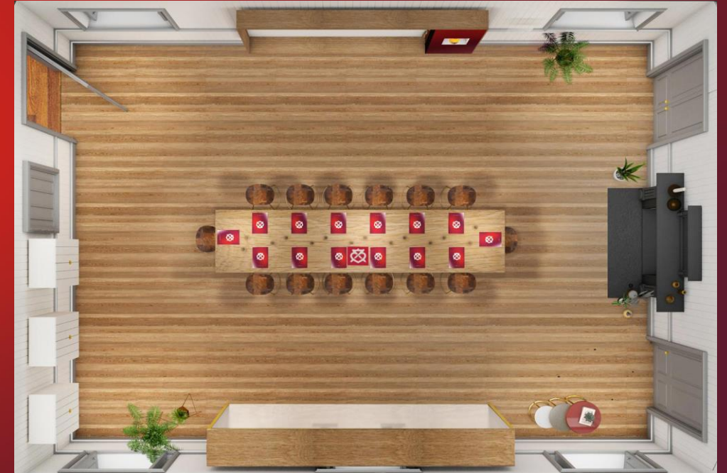
Story room view