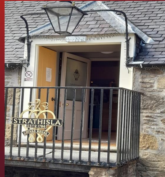
Main entrance view