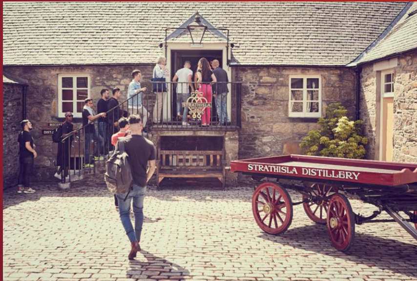
Main entrance view from courtyard