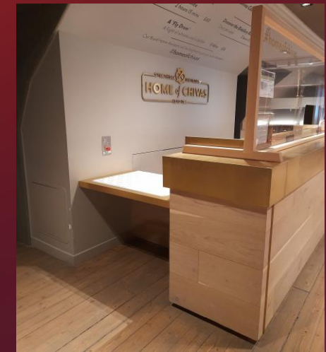
Ticket desk with low counter