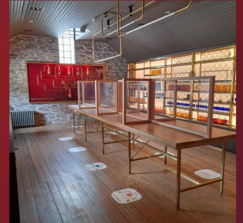
The Blending room with low lighting