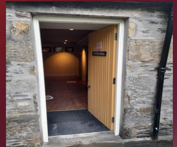
Lower Hall entrance view