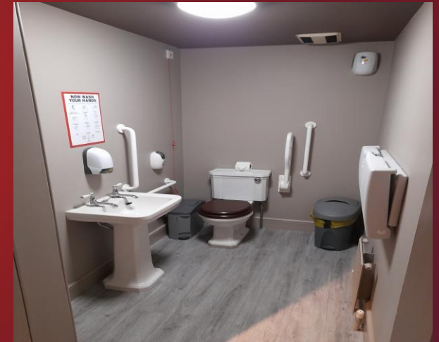
Accessible Toilet view