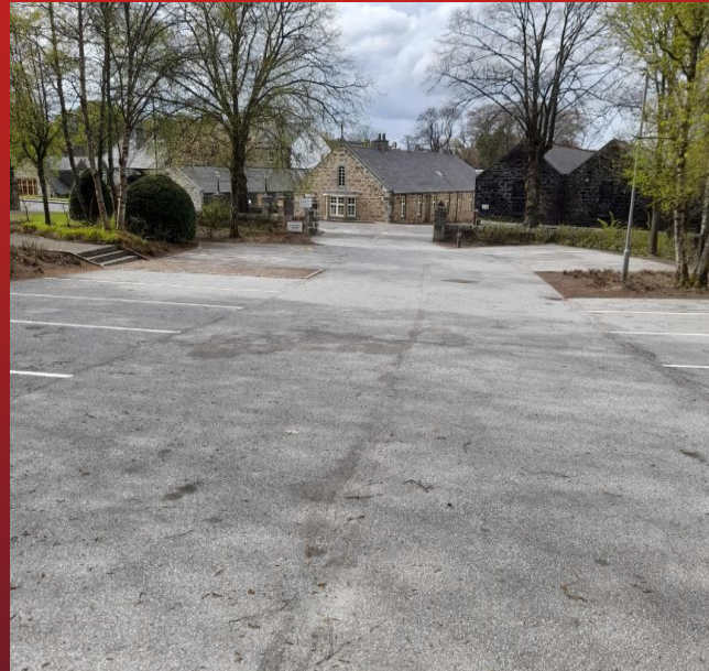
Carpark view opposite from street